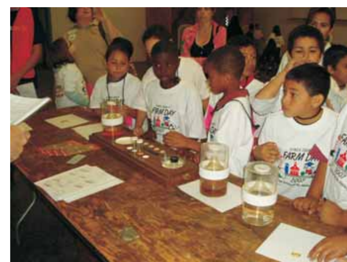
Gardenside students learn about keeping mosquito populations down as they look at water samples.