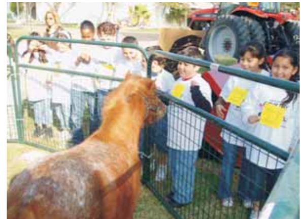
Honey greets a HESD Monroe class.