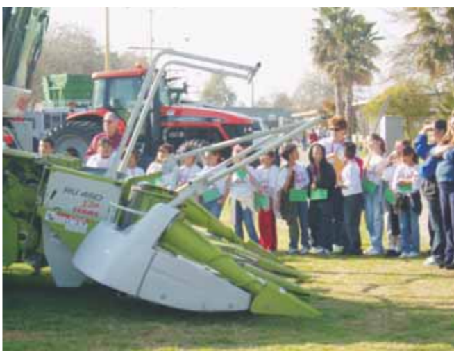
Students learn about different types of farm equipment.