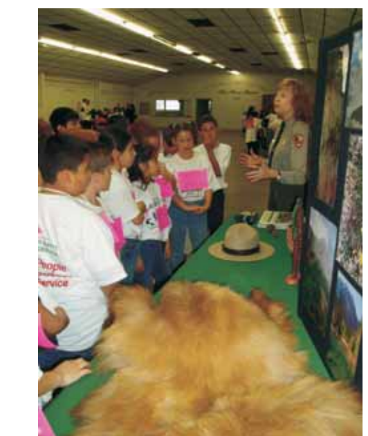
A ranger talks to students from PW Engvall School about the National Park Service and lets them experience touching a bear skin.