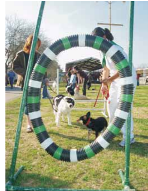
The dog agility course demonstrated by county 4-H members drew lots of appreciative applause.