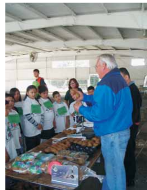
Students are given a lesson on how kiwis are grown and packaged.