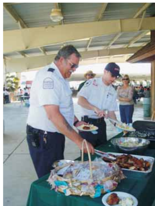
Volunteers enjoy a delicious lunch after they complete their assigned tasks.