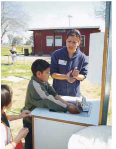
Hand-washing is available, and encouraged, after touching animals.