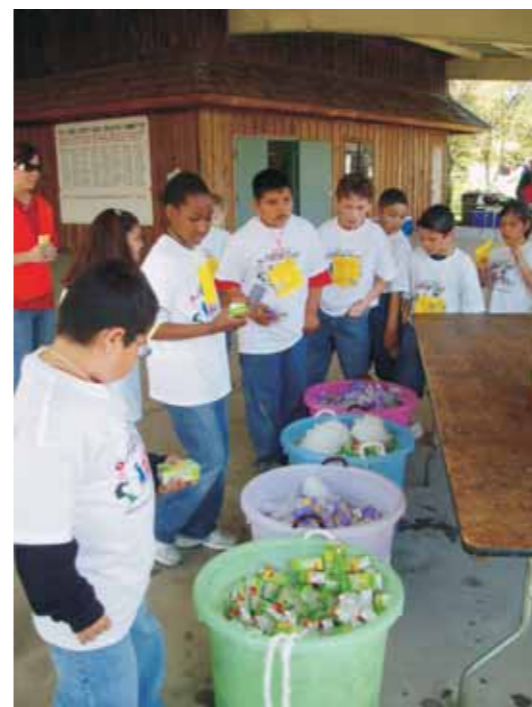
Cold juice boxes await thirsty students as they near the end of their stay at Farm Day.