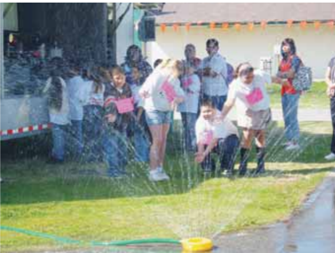
Students learn the value of conserving water during a demonstration.