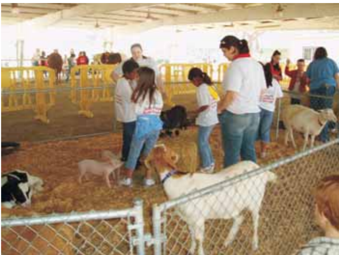
CWA members allow students to pet a variety of animals.