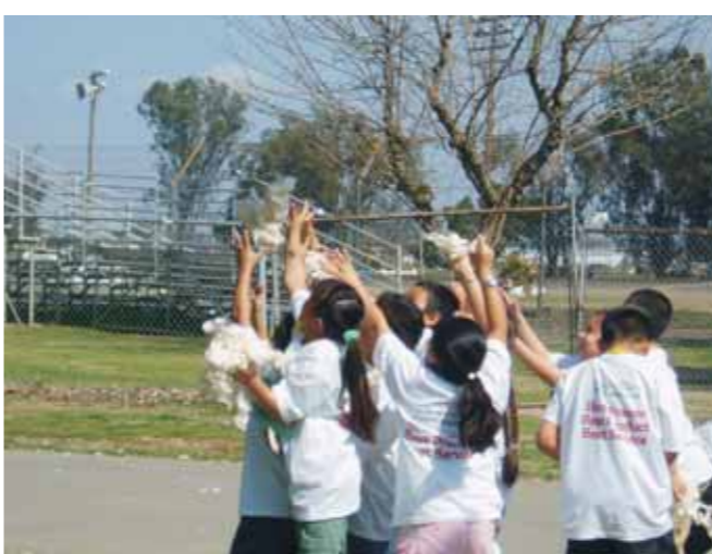
After seeing how a cotton picker works, students have fun catching the falling cotton.