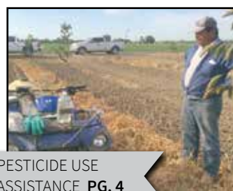
PESTICIDE USE ASSISTANCE PG. 4