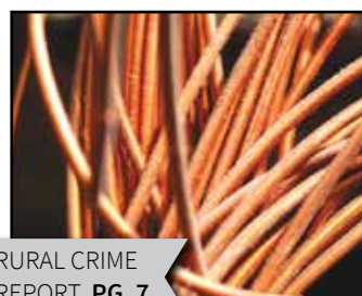
RURAL CRIME REPORT PG. 7