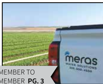
MEMBER TO MEMBER PG. 3