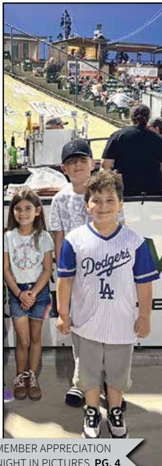
MEMBER APPRECIATION NIGHT IN PICTURES PG. 4