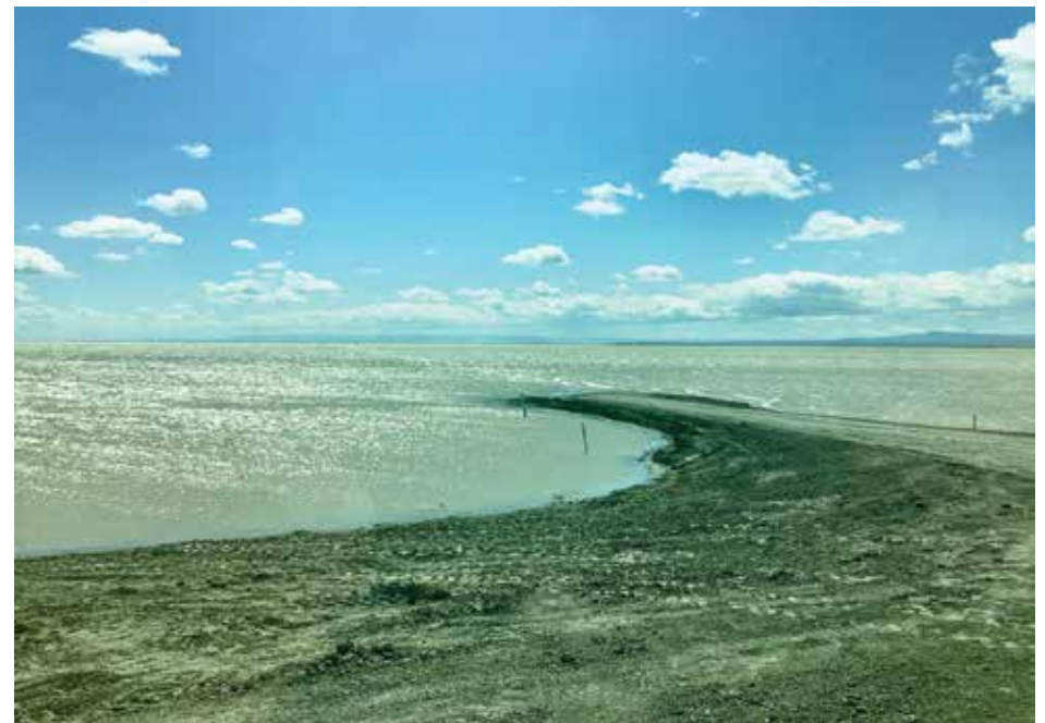
This photo taken at Nevada Avenue looking south shows the scope of the floodwaters.

With the rain comes a mix of emotions for the Central Valley's farming industry. Water allocations have gone up, so farmers who had projected allocations of zero will now have plenty to plant fields that may have otherwise gone fallow. On the other hand, those with farms or homes close to creeks, canals, riverbeds, and the lowest elevations in the county (Tulare Lake), must worry about levee breaks and flooding.