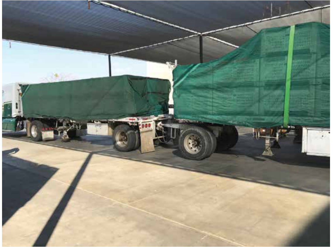
As part of the county's efforts to stop the spread of Asian Citrus Psyllid, citrus loads are carefully secured with tarps and inspected upon arrival in Kings County.