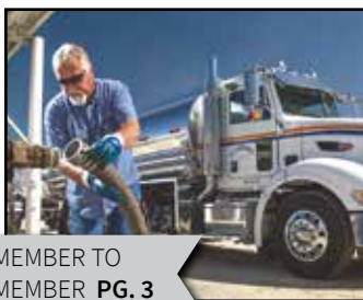
MEMBER TO MEMBER PG. 3