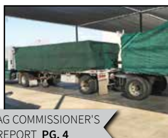
AG COMMISSIONER'S REPORT PG. 4