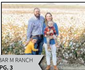
BAR M RANCH PG. 3