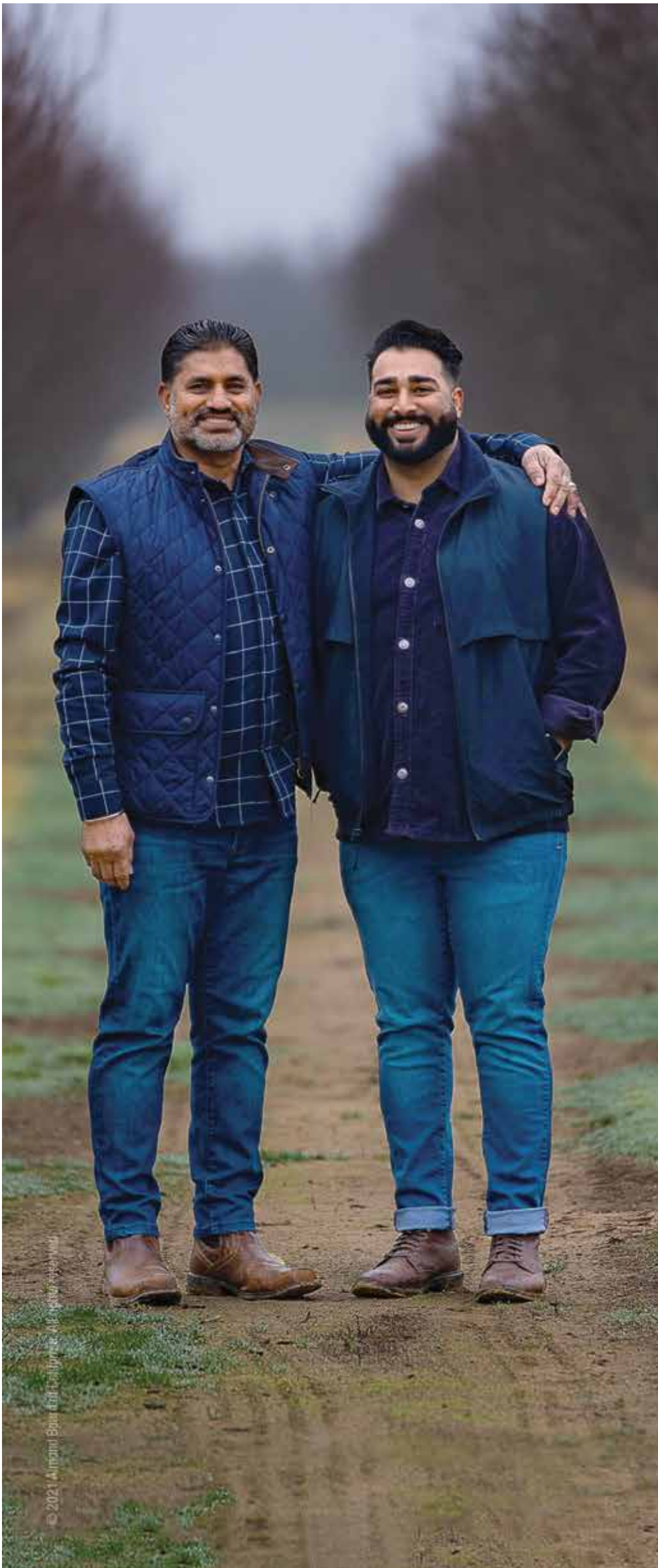
© 2021 Almond Board of California. All rights reserved.

DECEMBER 7-9, 2021 THE CONFERENCE IS FREE TO ATTEND. REGISTRATION IS NOW OPEN AT ALMONDS.COM/CONFERENCE