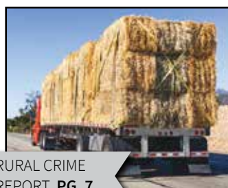
RURAL CRIME REPORT PG. 7