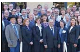
AG COMMISSIONER COMPLIANCE REPORT PG. 4