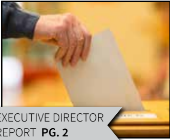
EXECUTIVE DIRECTOR REPORT PG. 2