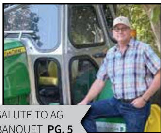
SALUTE TO AG BANQUET PG. 5